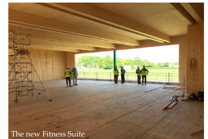
The new Fitness Suite

More details on the development will be made available to the School community next term.