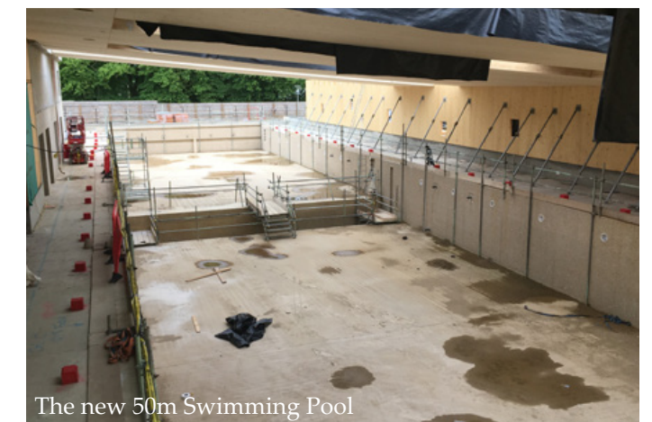
The new 50m Swimming Pool